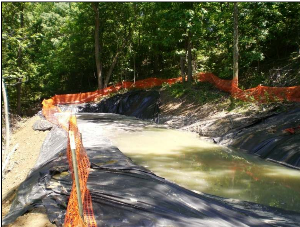
Figure 7. Photograph of a poorly lined produced water pit at a natural gas drilling site near Nitro, West Virginia. The plastic tarp used to line the pit had leaked, causing a fish kill event within a nearby stream.

Erosion, landslides, and soil loss can occur as a consequence of drilling pad construction and associated traffic, including transport of water to the site [EPA, 2007].