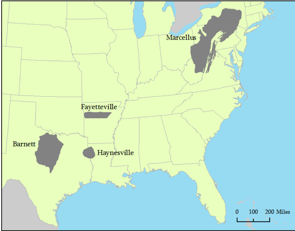
Figure 5 (above). The four major gas shale areas in the central and eastern US are the Barnett, the Haynesville, the Fayetteville, and the Marcellus formations. The following map shows where the resources are located [Data from FracTracker, 2010].